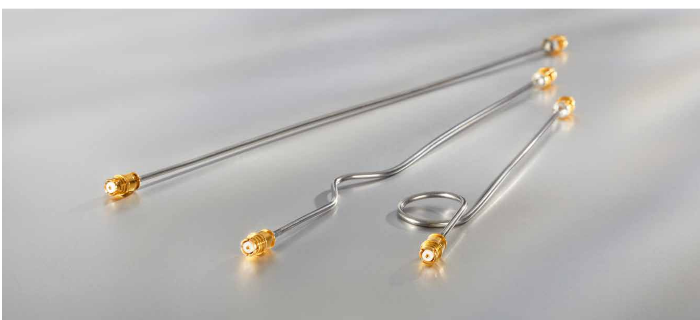
SMP cable assemblies from Rosenberger for cryogenic applications